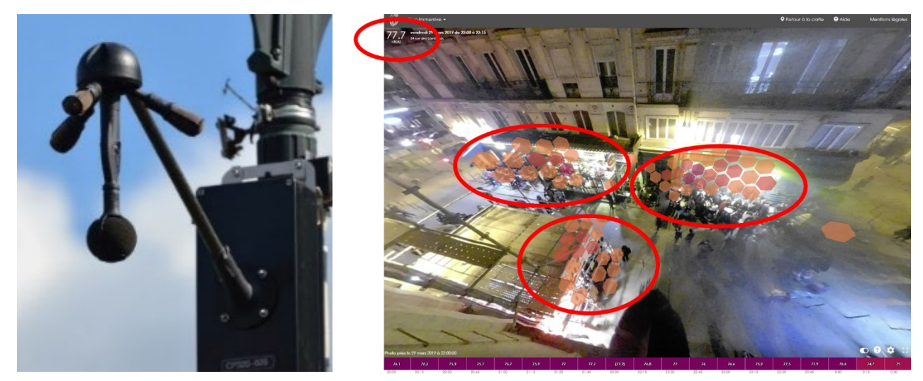
Figure 1: Medusa sensor (on the left) and example of immersive view (on the right)

The Medusa sensor operates on the principle of a simplified acoustic antenna: it has four microphones arranged in a tetrahedron shape, making it possible to measure not only the sound level but also the direction of origin of the dominant noise, at each instant. A 360° camera integrated into the device takes a photograph of the environment every 15 minutes, allowing, after computer processing of the data, a visualization of the noise by its projection in the image in the form of coloured hexagons. So we have access to two pieces of information at one glance: both the location of the main sound source in the image, and the associated sound level thanks to a colour scale varying according to the measured intensity.